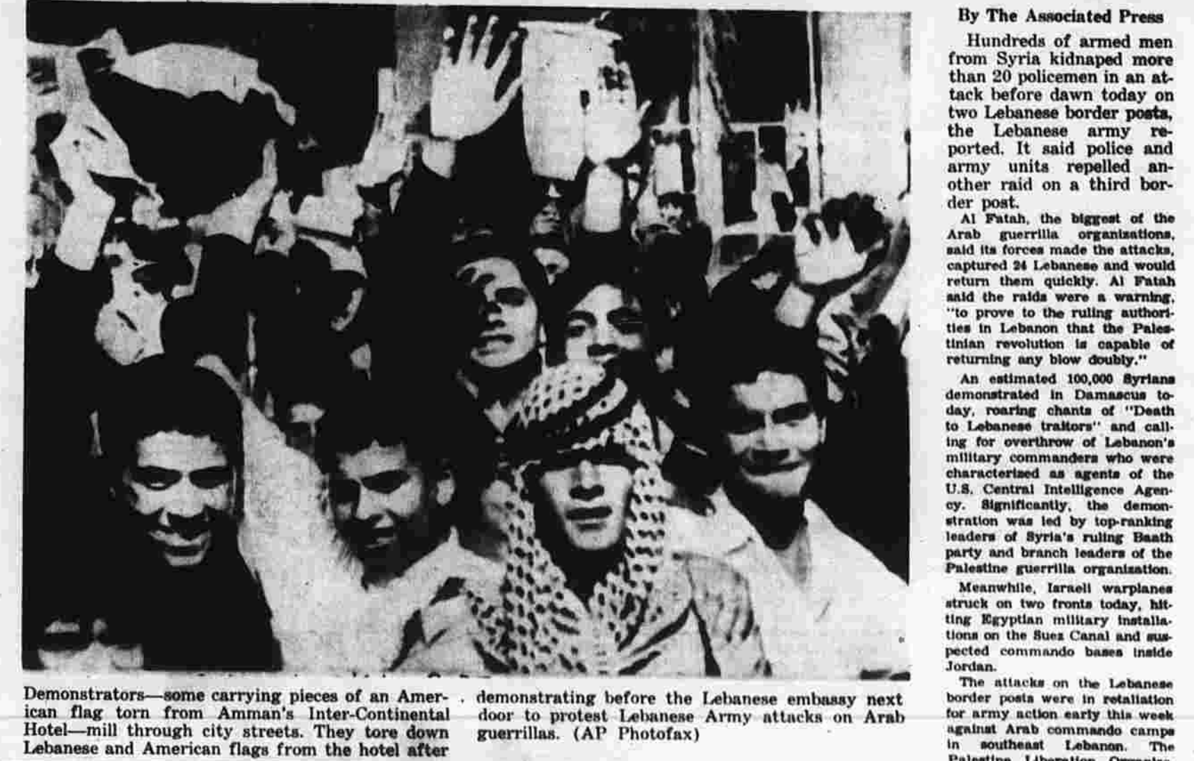
By The Associated Press Hundreds of armed men from Syria kidnaped more than 20 policemen in an attack before dawn today on two Lebanese border posts, the Lebanese army reported. It said police and army units repelled another raid on a third border post.