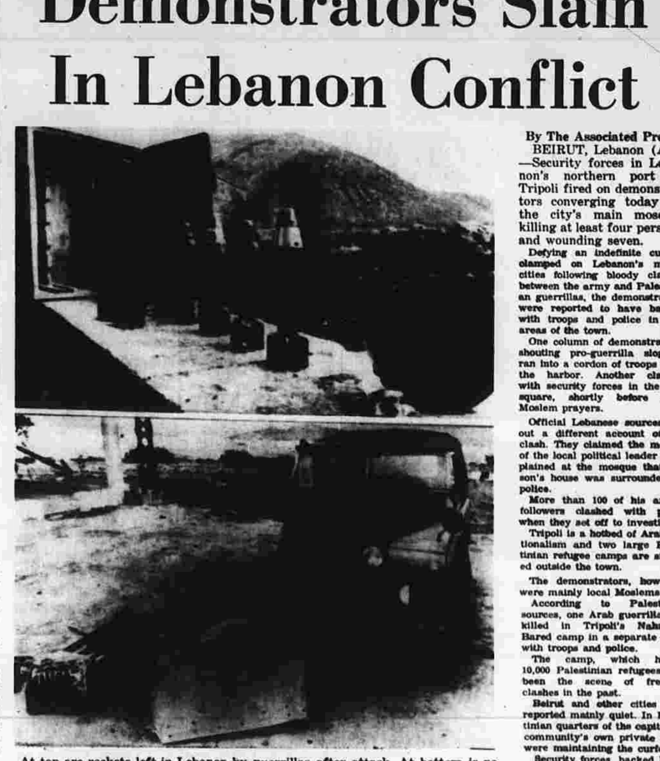
At top are rockets left in Lebanon by guerrillas after attack. At bottom is police vehicle damaged by attackers' mortar fire.