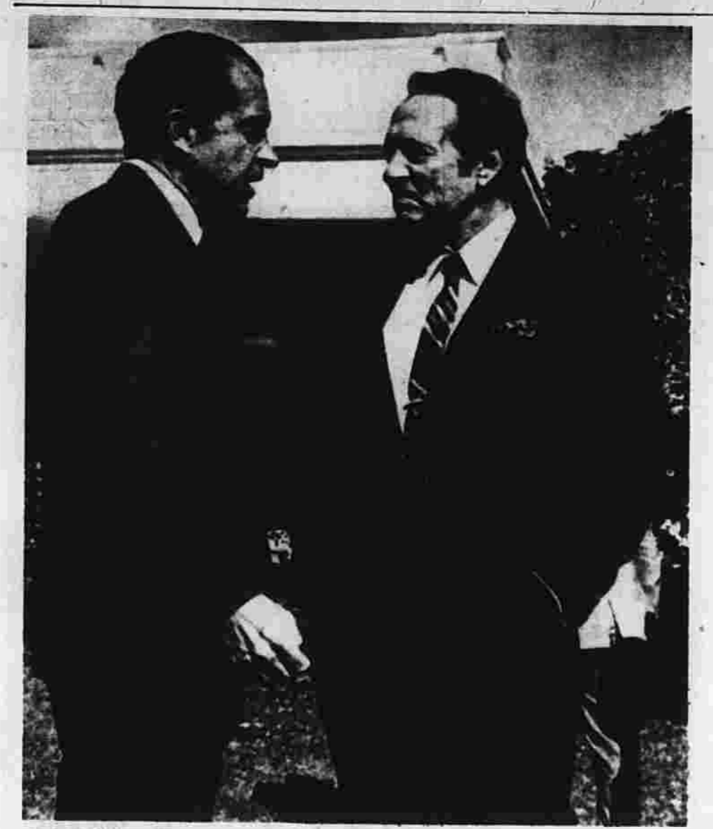
Art Linkletter meets with President Nixon concerning campaign against dangerous drugs.

ACRES OF FREE PARKING • C.A.P. and C.B.T. MOST STORES